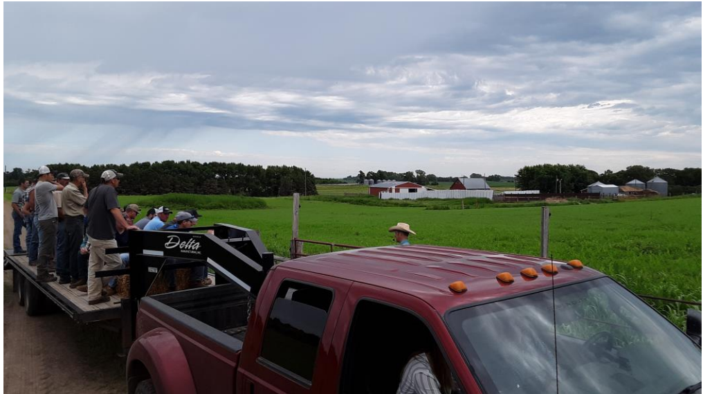
Jared Namken discusses the use of planting cover crops in their backgrounding lot to keep dust down during the fall/winter backgrounding phase of their operation.

I can't always get to every tour each year, but I did attend the Namken Red Angus tour. One interesting practice I liked was how Jared Namken would plant their drylot to cover crops to keep the dust down when they wean their calves and background them in the fall.